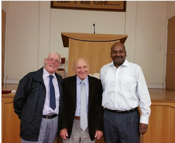
Ridley Hall, London