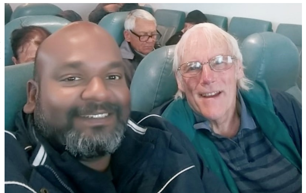
On the boat from Isle of Man